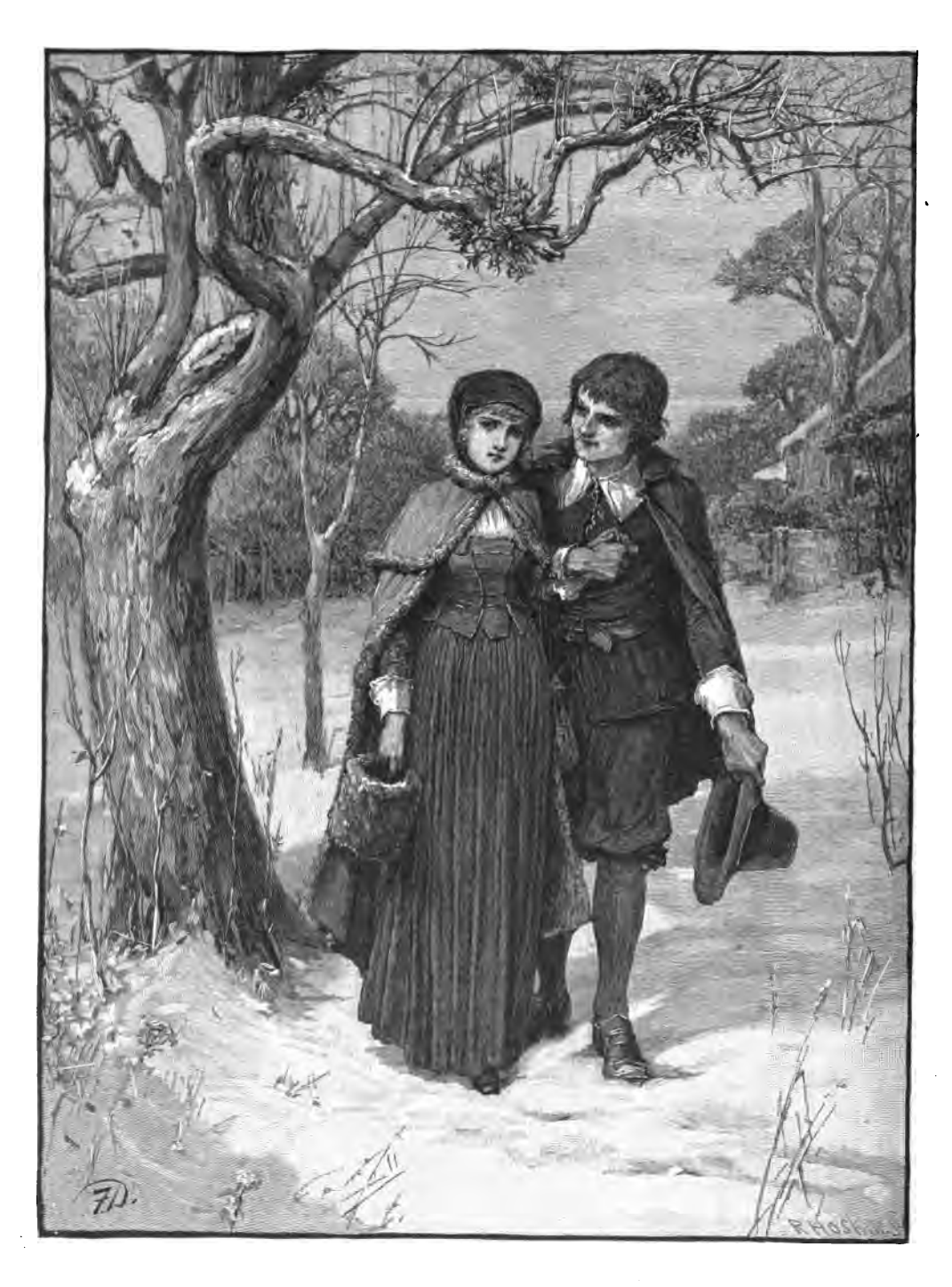
UNDER THE MISTLETOE.—DRAWN BY FREDERIC DIELMAN.