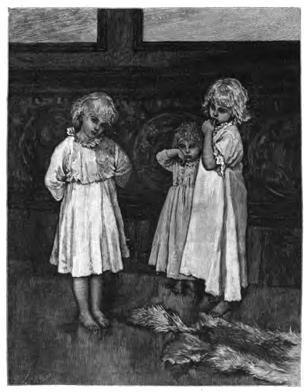
THE CHRISTMAS WAITS AT BRACEBRIDGE HALL.

Nothing we see but means our good, As our delight or as our treasure; The whole is either our cupboard of food, Or cabinet of pleasure."