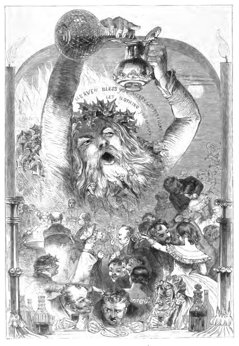
MERRY CHRISTMAS.—FROM THE PICTURE BY KENNY MEADOWS.